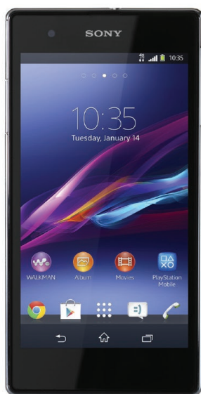
Sony Xperia® Z1s

+ $26/mo for 24 months. If you cancel wireless service, remaining balance on device becomes due. O.A.C.