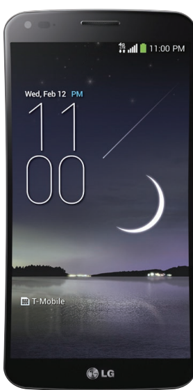
LG G Flex

+ $18/mo for 24 months. If you cancel wireless service, remaining balance on device becomes due. O.A.C.