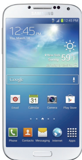
Samsung Galaxy S® 4