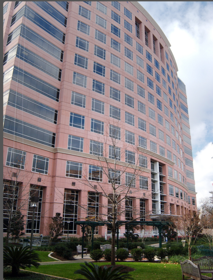
John Mendelsohn Faculty Center