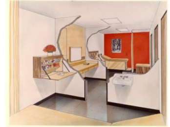
The Lutherman Pavilion, Office and Conference Room drawing 1974